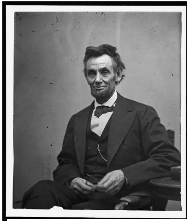
Abraham Lincoln, 1865, Library of Congress

For Visual Sources: Include the content of the image, date, and where you found the image.