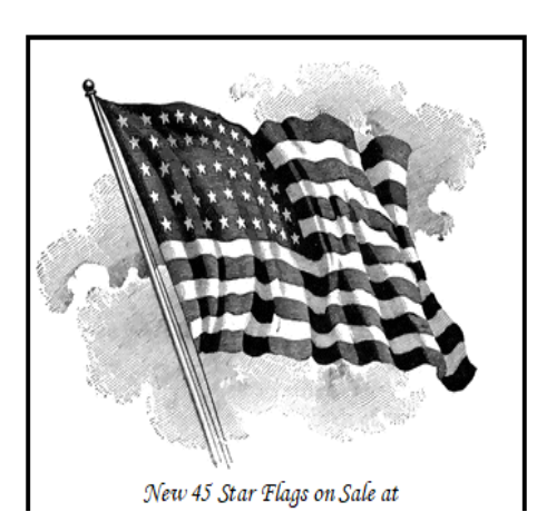
The Village Mercantile