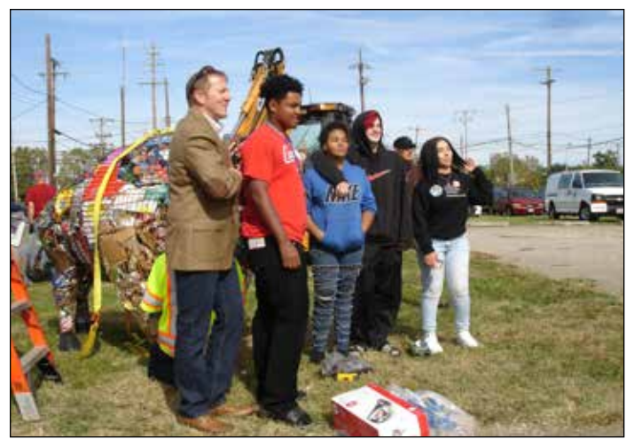
Franklinton Preparatory Academy students and principal at the Franklinton community's celebration of the wood buffalo.

An ancient wood buffalo trace led northward from the salt springs of Blue Licks, Kentucky, across a ford in the Ohio River to Upper Sandusky following the Scioto River. Lucas Sullivant,