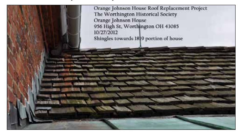
"Before." The state of the roof illustrating the need for replacement.