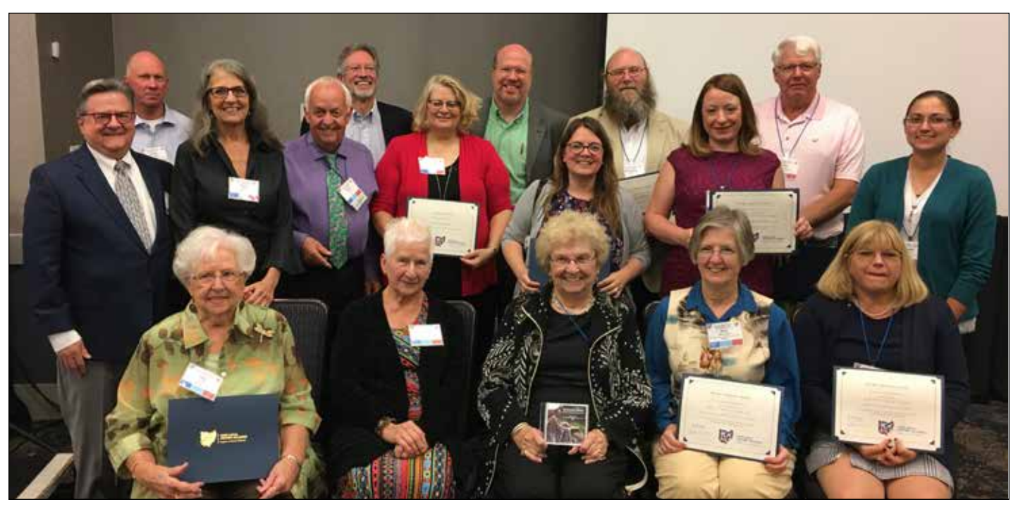
The 2019 winners of the Ohio Local History Alliance's Outstanding Achievement Awards pose after the Awards Luncheon at the Annual Meeting.