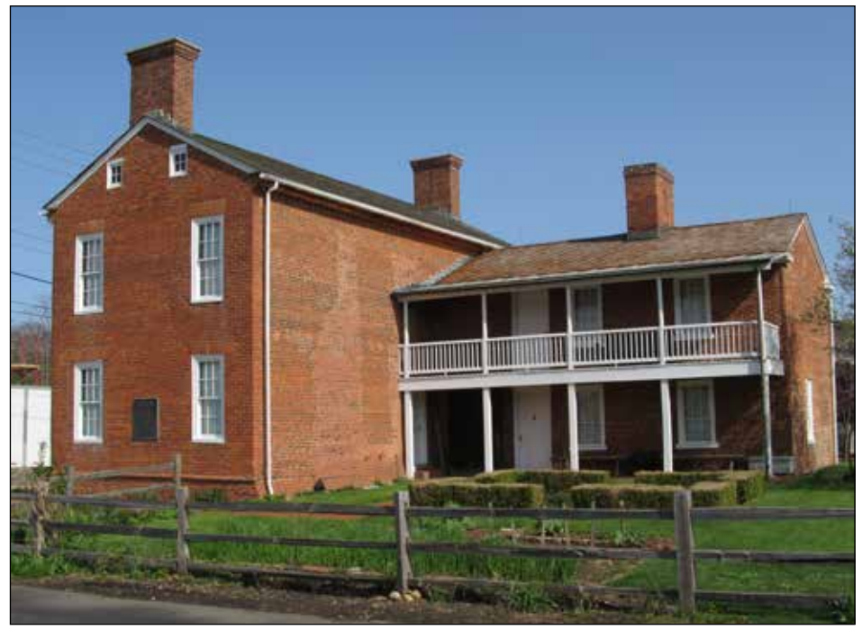
The Orange Johnson House of the Worthington Historical Society. A grant from the Ohio History Fund helped the Society replace the roof over the "porched" rear of the house, built in 1811.

We also hope these stories inspire you to give. As The Local Historian will proclaim during tax season, 100% of the money for History Fund grants is voluntarily given. It comes from donations of state income tax refunds, the sales of Ohio History "mastodon" license plates, and direct contributions to the Ohio History Connection for the History Fund. The more the History Fund receives in donations, the more it grants back to organizations like yours – maybe yours, if you apply!