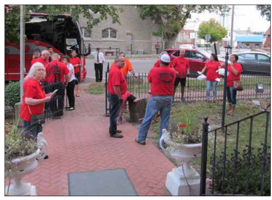
Citizens from the Wyandot Nation of Oklahoma depart the bus in from of the Wyandot County Museum prior to visiting the site on September 20.

The first strictly Wyandot church service in the Mission Church in over 176 years was held on the morning of Sunday, September 22nd. The two busses of Wyandots next travelled to the Indian Mill to take part in an Open House to commemorate the 200th anniversary of the original dam and sawmill built for the Wyandots in 1819 per the stipulations of Article 10 of The Treaty of the Maumee Rapids in 1817. Following another small ceremony in Delaware later that afternoon, the Wyandots headed home after a brief weekend visit to their ancestral homelands.