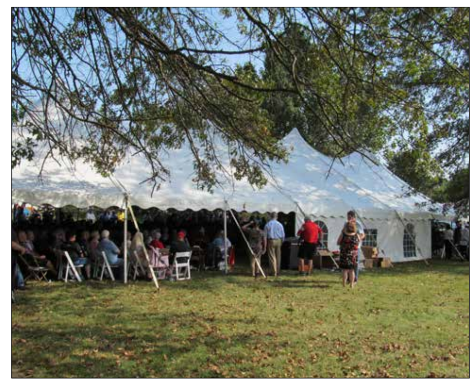
The large tent set up in Old Mission Cemetery to house the formal deed transfer ceremony on September 21.