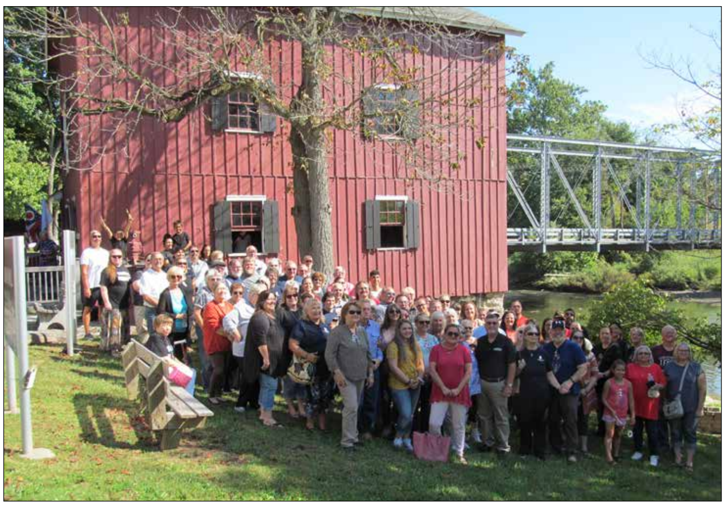
The Wyandotte Nation visitors pose for a group photograph outside of the Indian Mill on September 22.