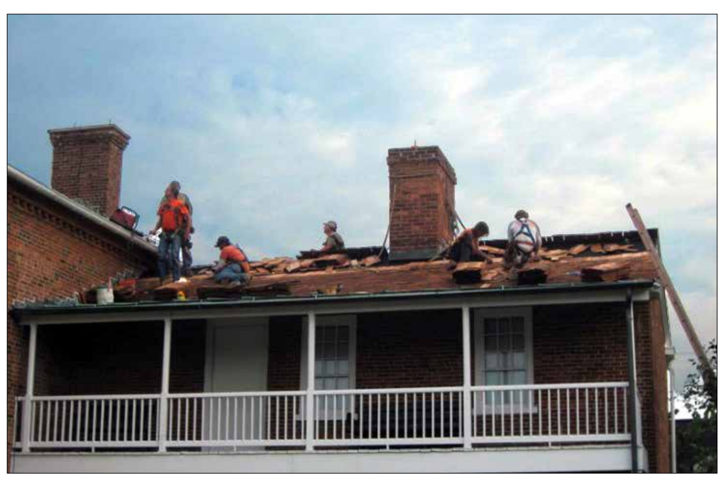
"During." Roofers proceeding with the work.

the organization's three properties. The house consists of two sections, a rear section with porch, built in 1811 – the original house, and the 1819 Federal-style addition, the front facing the street.