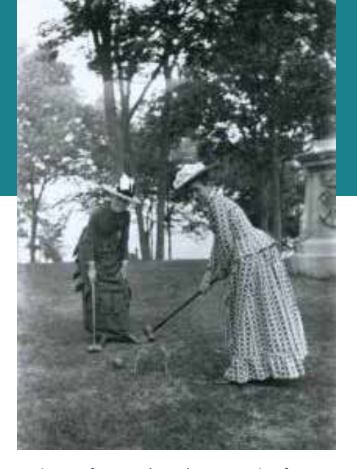
An image from a glass plate negative from the Ohio History Connection's collections.

The best choice of enclosure for glass plates is a four flap negative envelope. These envelopes completely enclose the plates. Putting glass plates in envelopes or folders with open sides leave the plates vulnerable to slipping out. Flaking and peeling emulsion is a common problem with glass plate negatives. Pulling plates in and out of envelopes or sleeves poses the risk of catching and tugging on emulsion that is peeling away from the glass base. Four flap envelopes can be opened and plates inspected or removed without the plates rubbing against the enclosure. This style of envelope can be purchased from archival suppliers in standard sizes. When you are rehousing glass plate negatives you may find plates that are fused together. This is especially common when plates have