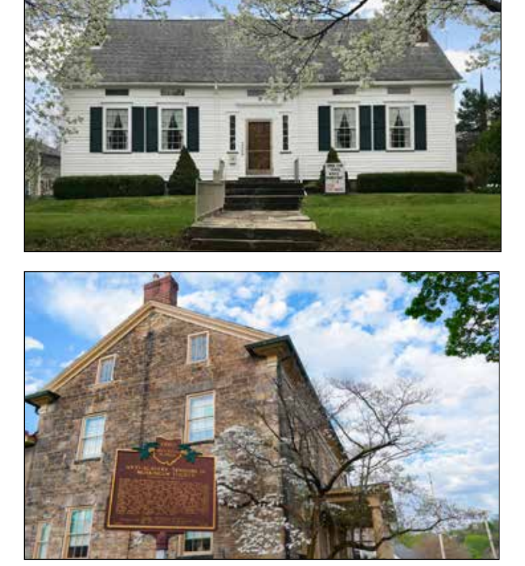
Top: John Stark Edwards House. Bottom: The Stone Academy in Zanesville.

The Region 9 meeting on March 9 will be co-hosted by the Meigs County Historical Society and the Chester