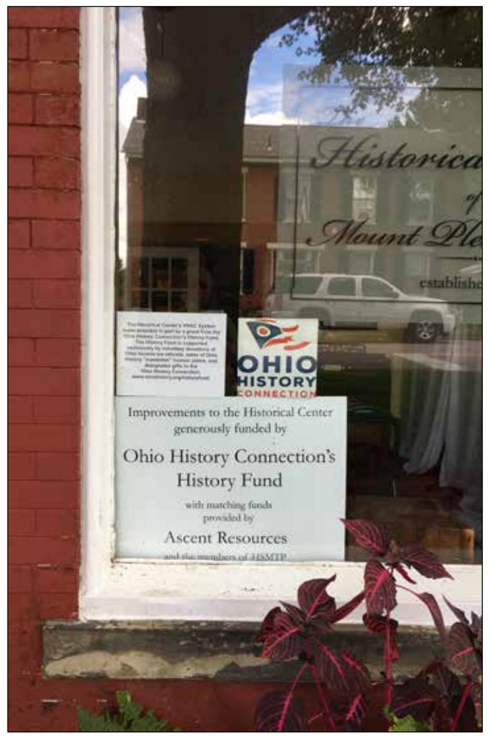
Top: Nestled among the bushes at the east side of the historical center is a unit that is a part of the society's new climate-controlling HVAC system. Bottom: A sign about the Ohio History Fund project graces the front window of the Historical Society of Mount Pleasant.

contemporary use while preserving those portions and features of the property which are significant to its historic, architectural, and cultural values." The Alliance Historical Society has been a member of the Ohio Local History Alliance since 1989.