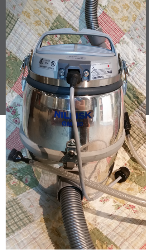
Vacuums like this one are a key tool for taking care of all your historic textiles.

by-step, row-by-row method; that is, pick up the brush and move it over slightly before pressing down again. Try to avoid using rubbing or scrubbing motions, which can cause damage to the fabric. If your textile has areas where it is more three-dimensional (for instance, on a flocked velvet piece), use a natural bristle brush to gently "flick" the dust from these areas into the covered attachment of your vacuum cleaner. This method will prevent the raised elements from being ground down or damaged by the weight of your vacuum.