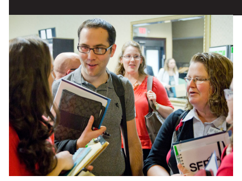
You'll have lots of time to network with your colleagues at the Alliance's Regional Meetings.