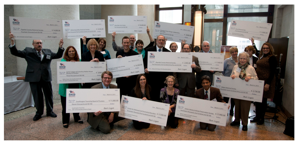
The 2015 History Fund grant recipients pose with their "big checks" at Statehood Day.

Society (Youngstown) received $4,526 to digitize microfilm copies of records from Republic Steel from the 1880s – 1960s, and scrapbooks compiled by former Youngstown mayor Charles P. Henderson, who cracked down on organized crime in the city in the late 1940s and early 1950s. This project will make these materials more accessible to the public, and better ensure the preservation of the original records.