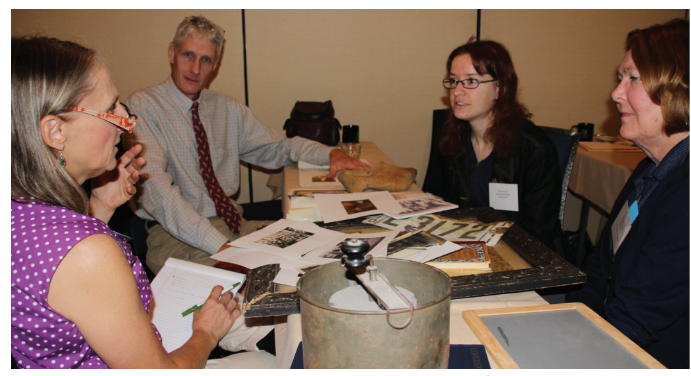
Regional meetings are a great chance to reconnect with long-time friends and make new ones.

Each regional meeting agenda is created by your peers, who heavily rely on your comments and suggestions from the previous meeting's evaluations. Every