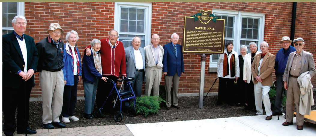
Wilmington College alumni and former faculty attend the dedication of a marker commemorating the dorm they helped build, Marble Hall, on Wilmington College's campus. This marker was awarded an Ohio Historical Marker grant and an Alliance Outstanding Achievement Award.

front of saloons - it could be violent, too.