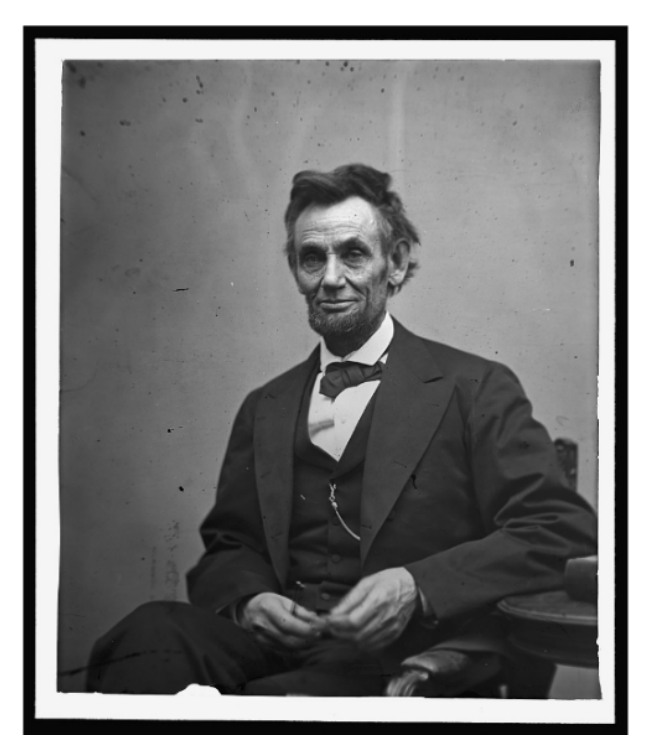
Abraham Lincoln, 1865

For Visual Sources: Include the content of the image, date, and where you found the image.