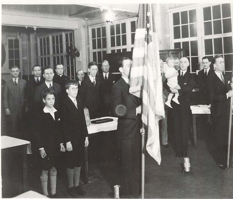
Image: Dedication of the Malcolm Jeffrey American Legion Post #465 (1935)