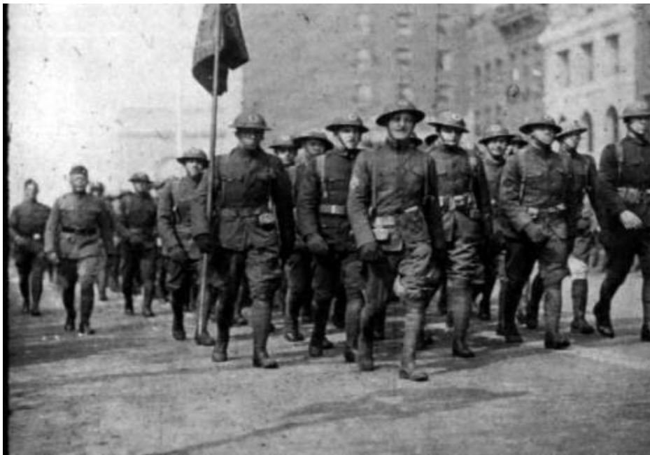
Image: Jeffrey's Battery (Battery B) returns to Columbus, Ohio, 1919.

Compelling Question: How does industrialization and immigration impact Ohioans in World War I?