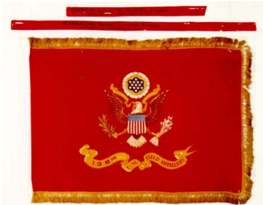
Image: Regimental Colors of the 136th Field Artillery Regiment, 37th Infantry Division.