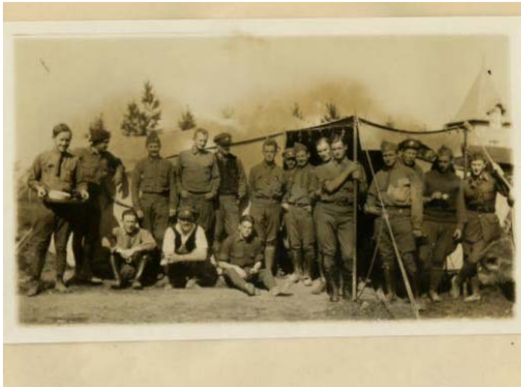
Image: ARMCO Ambulance Corps