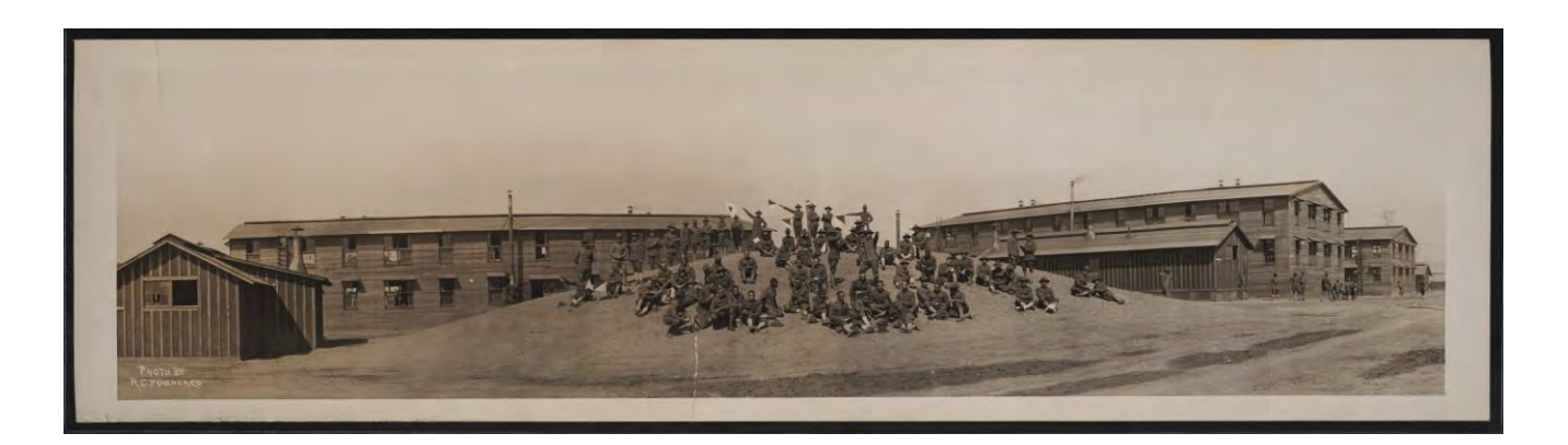
Image: Company A, 325th Field Signal Battalion photograph, March 18, 1918.