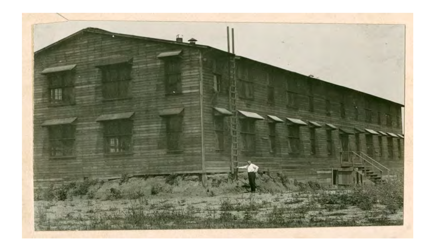
Image: Showing cuts made by street grading, Mound City Mound #23. A Camp Sherman barracks is pictured sitting atop Mound #23, part of the Mound City Earthworks.